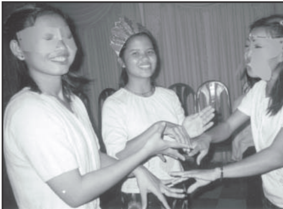
Practising Cambodian traditional dance

We know that is a big step for us. We want to show that young people have something to say to adults, that we can work with older people, not just with youth.